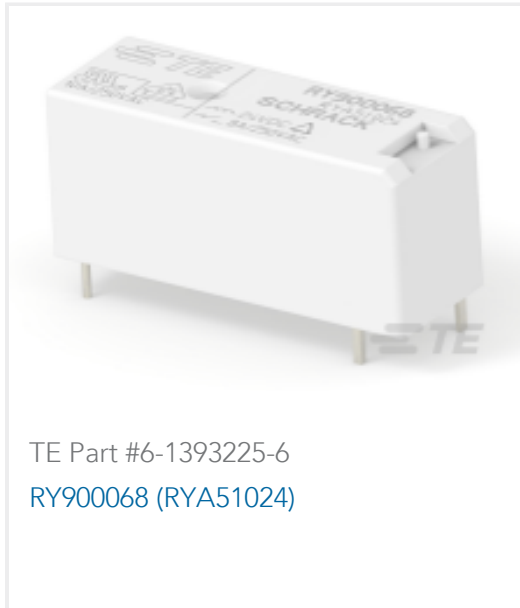
TE Part #6-1393225-6 RY900068 (RYA51024)