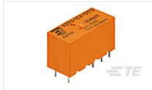
TE Part #1-1415899-8 RZ03-1A4-D048