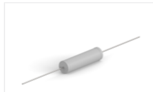
TE Part #4-2176414-8 7W STD M/OX 5% 1K8