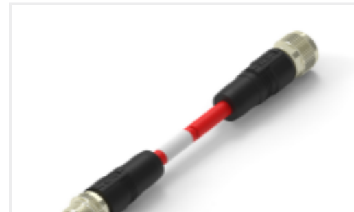
TE Part #TAA545B1411-060 M12A4-MS-FS-PVC-6.0M