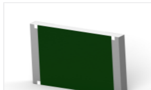
TE Part #8-2176407-8 3560 27R 5%