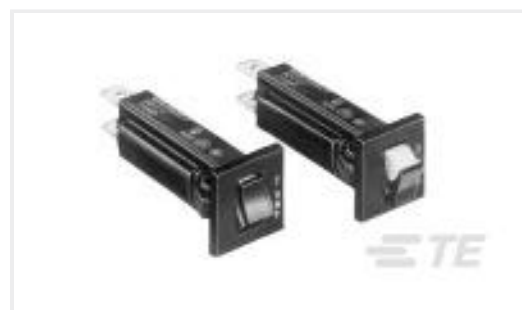
TE Part #1-1393250-7 W28-XQAT-15=W28