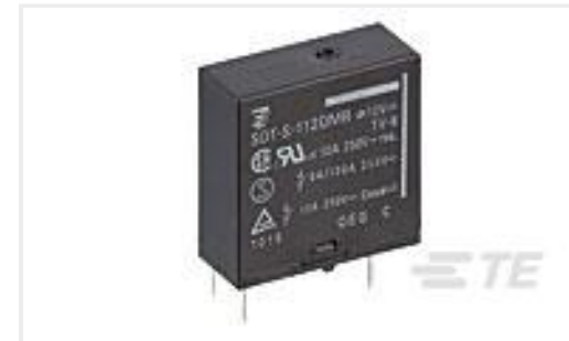
TE Part #8-1419125-5 SDT-S-106LMR,000