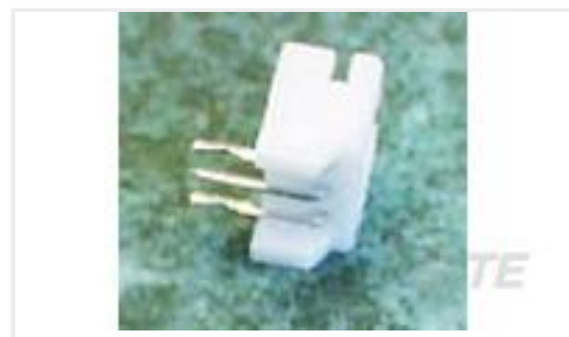
TE Part #1-440055-1 2.0MM,HDR,11POS,R/A