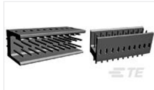
TE Part #826469-3 2X3P MOD II SHROUDED HEADER, ST