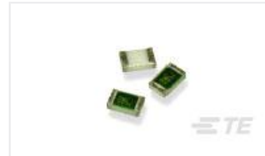
TE Part #1879337-1 CPF 0603 2K49 1% 50PPM 1K RL