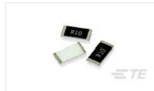
TE Part #3-2176057-1 RLP73K 3A R18 1% 1K RL