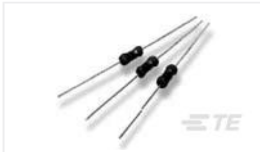
TE Part #4-1625892-9 3W SM M/OX 5% 3R3