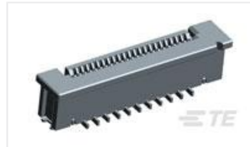
TE Part #1-1734742-0 .5 FPC VT ZIF Type-A 10 CONT