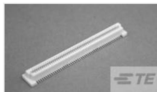
TE Part #5177983-2 0.8FH,R05H.5,060,08/Sn,TU