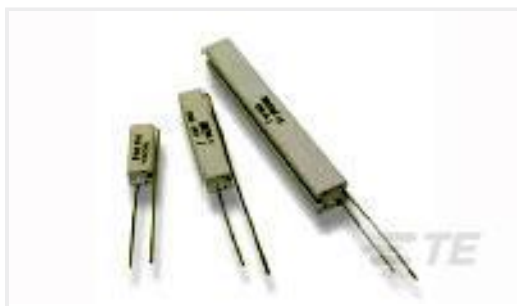
TE Part #1623728-1 BCHE 11 W 100R 5%