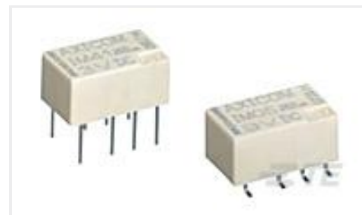
TE Part #5-1462037-4 IM41GR=IM RELAY 100mW 3V BIS