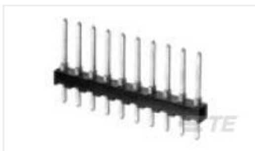
TE Part #5-827730-0 50P MOD 2 STIFT LEI