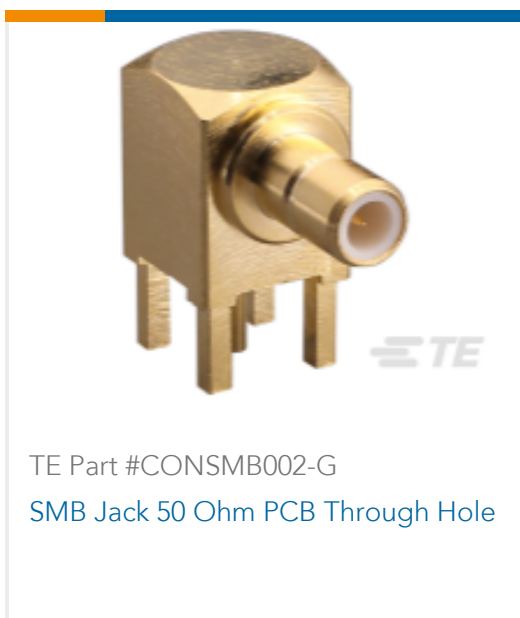
TE Part #CONSMB002-G SMB Jack 50 Ohm PCB Through Hole