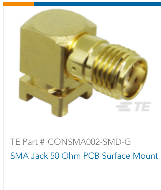
TE Part # CONSMA002-SMD-G SMA Jack 50 Ohm PCB Surface Mount