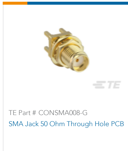
TE Part # CONSMA008-G SMA Jack 50 Ohm Through Hole PCB