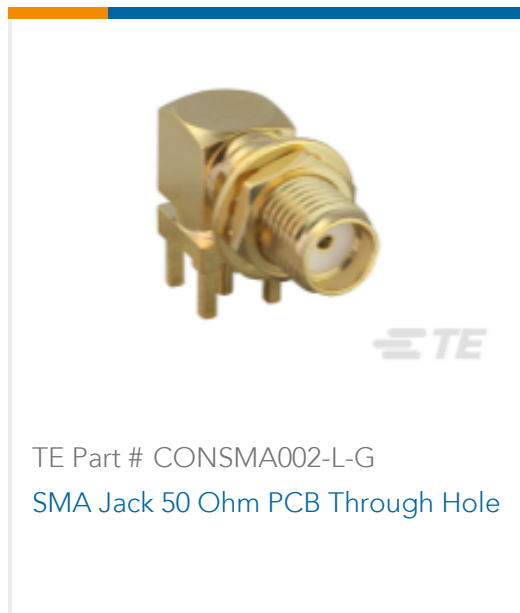
TE Part # CONSMA002-L-G SMA Jack 50 Ohm PCB Through Hole