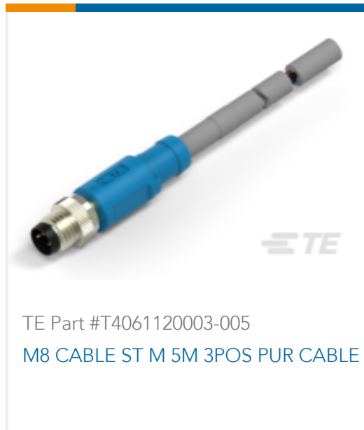
TE Part #T4061120003-005 M8 CABLE ST M 5M 3POS PUR CABLE