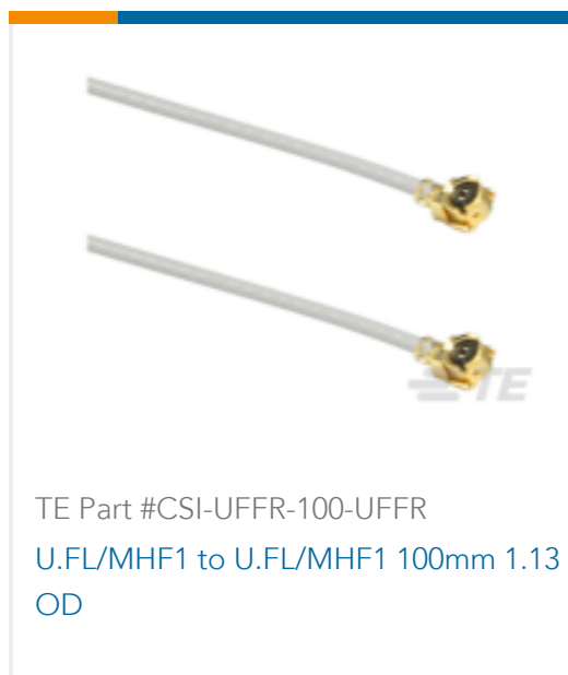
TE Part #CSI-UFFR-100-UFFR U.FL/MHF1 to U.FL/MHF1 100mm 1.13 OD