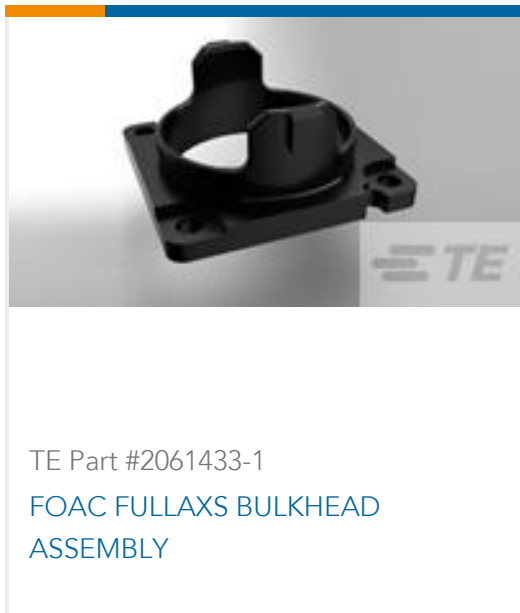
TE Part #2061433-1 FOAC FULLAXS BULKHEAD ASSEMBLY