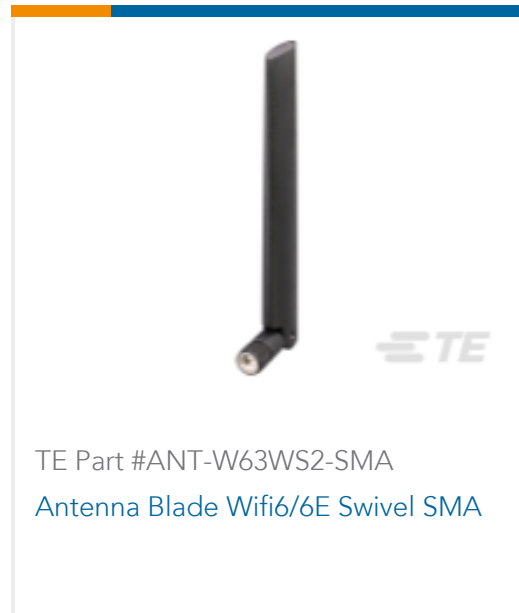
TE Part #ANT-W63WS2-SMA Antenna Blade Wifi6/6E Swivel SMA