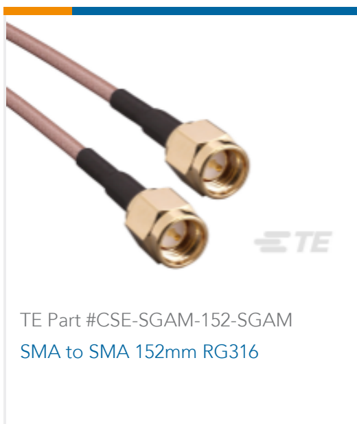
TE Part #CSE-SGAM-152-SGAM SMA to SMA 152mm RG316