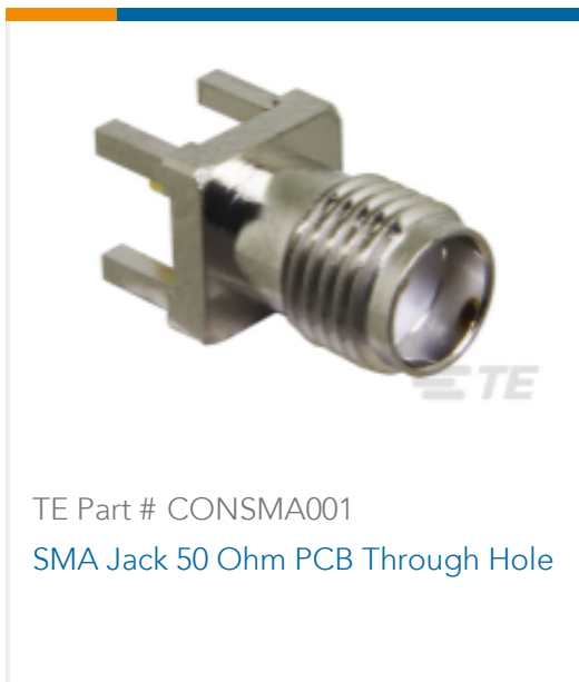
TE Part # CONSMA001 SMA Jack 50 Ohm PCB Through Hole