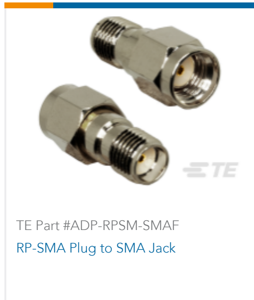
TE Part #ADP-RPSM-SMAF RP-SMA Plug to SMA Jack