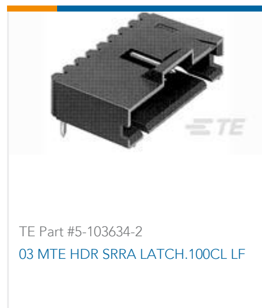
TE Part #5-103634-2 03 MTE HDR SRRA LATCH.100CL LF