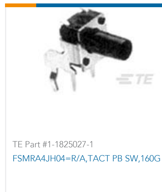
TE Part #1-1825027-1 FSMRA4JH04=R/A, TACT PB SW, 160G