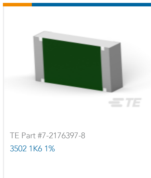
TE Part #7-2176397-8 3502 1K6 1%