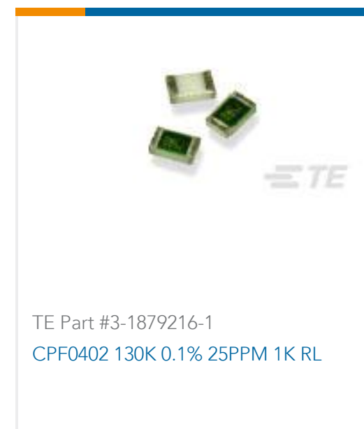
TE Part #3-1879216-1 CPF0402 130K 0.1% 25PPM 1K RL