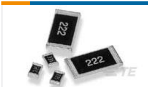
TE Part #2-1879494-5 CRGH0603 5% 10R 0.2W