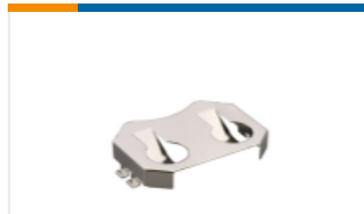
TE Part #BAT-HLD-001 Battery Holder 2032 2025 SMT Bulk Pack