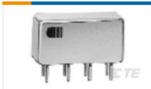
TE Part #1617037-9 HFW5A1201K00 = HFW 5AMP RELAY