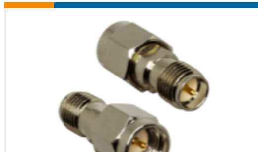
TE Part #ADP-SMAM-RPSF SMA Plug to RP-SMA Jack