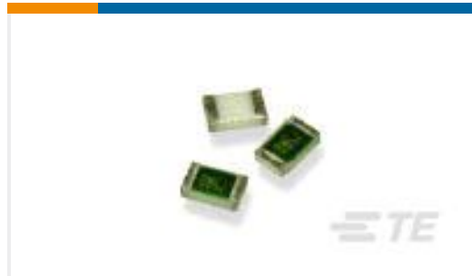
TE Part #1879208-7 CPF 0402 18R 0.1% 25PPM 1K RL