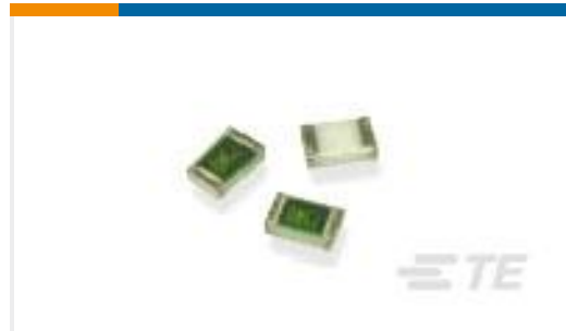
TE Part #1676322-2 RN 0805 3K01 0.1% 10PPM 1KRL