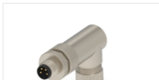
TE Part #T4013019041-000 M8, SCREW, MALE, R/A, SHIELD, 4P, GOLD