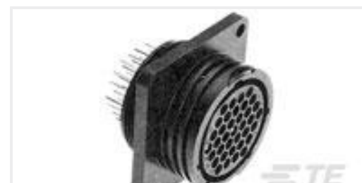
TE Part #208283-4 CPC RECPT ASSEMBLY SIZE 11-4