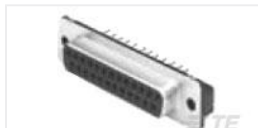
TE Part #5747301-8 37 RCPT SP/FMS INSR